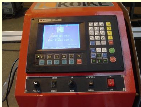
Koike D 410 control